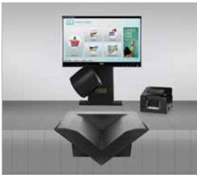
hybrid selfCheck™ components version 1 (mounted)

Our flexible solution can be configured to your exact specifications, allowing self-service operation in barcode, RFID or hybrid mode.