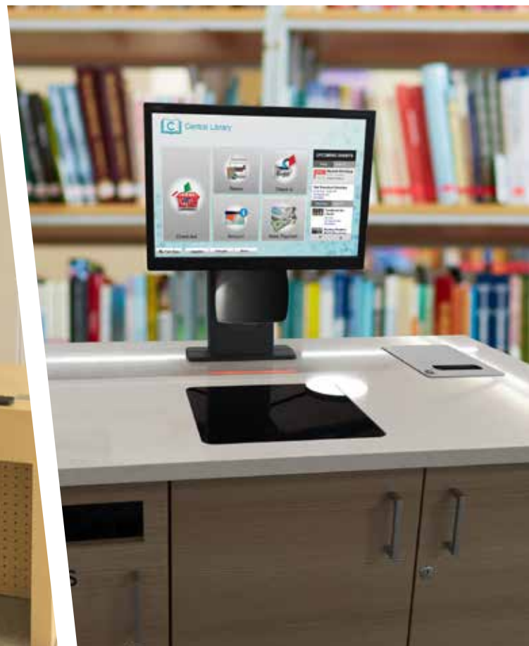
selfCheck™ Components RFID