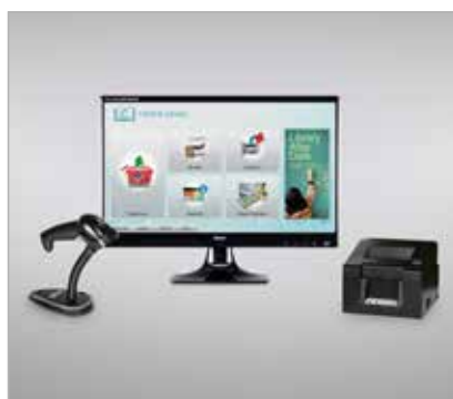
selfCheck™ components barcode version 1 (unmounted)