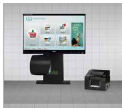
selfCheck™ components barcode version 2 (mounted)