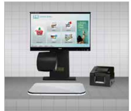
selfCheck™ components RFID version 2 (mounted)