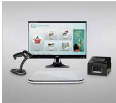
selfCheck™ components RFID version 1 (unmounted)